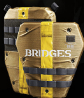
ARMOR PLATE (GOLD) IN-GAME ITEM

ALSO INCLUDED: PS4™ DYNAMIC THEME | DEATH STRANDING PSN AVATAR (NENDOROID LUDENS)