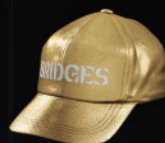
HAT (GOLD) IN-GAME ITEM