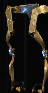
SPEED SKELETON (GOLD) IN-GAME ITEM